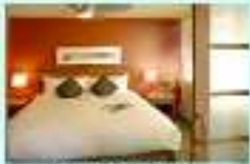
West Coast Suites