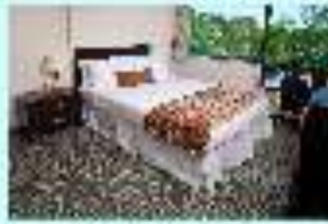
Gage Studio Suite