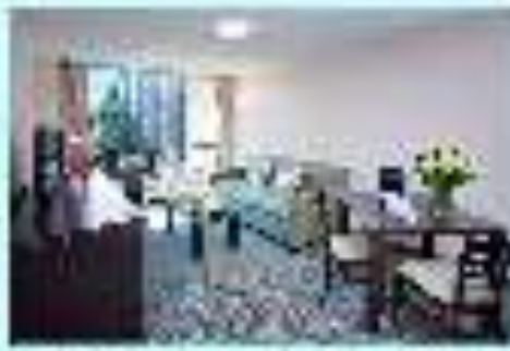
Gage One-Bedroom Suite